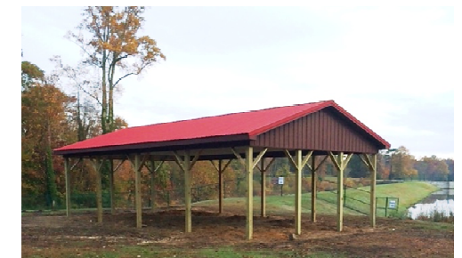
Pavilion at Alloway Lake

Voted New Jersey's Best Towns For Families * 2017 Salem County *