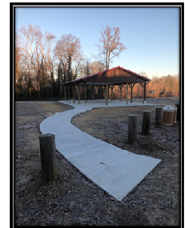
Pavilion at Alloway Lake